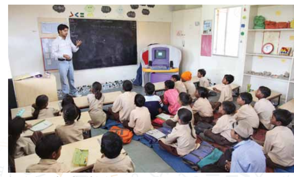
A regular day at a Satya Bharti School

While innovation, expertise and best practices are integral facets of the program, proactive intervention of teachers to undertake new initiatives also forms one of its most critical pillars. Our teachers are constantly reaching beyond the prescribed curriculum to undertake new programs and projects in order to help children learn better and with understanding. Two such examples that have helped both children and the teachers enhance the teaching-learning process are enumerated ahead.