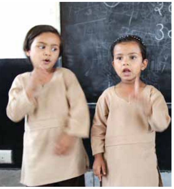
Students recite a poem during a lesson

These workshops organized solely by the teachers and for the teachers act as forums for self-development and also help them explore, share and improvise existing skills.