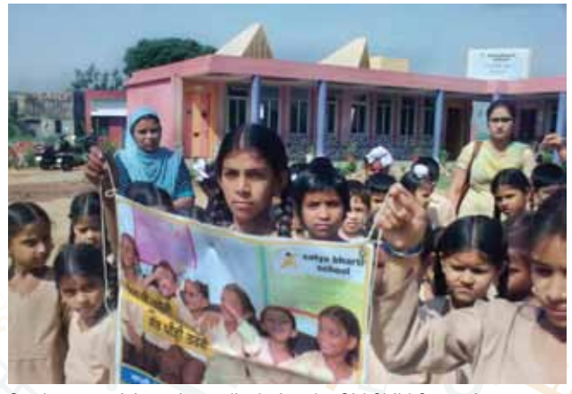
Students participate in a rally during the Girl Child Campaign

In 2009-2010, the Girl Child Campaign helped reduced the number of drop-outs of girls. The drop-out percentage of girls reduced from 1.37% in August 2009 to 0.2% in December 2009. Several Sarpanches of the villages also came forward with an oath to ensure that all girls from their respective villages will be enrolled and will regularly attend school.