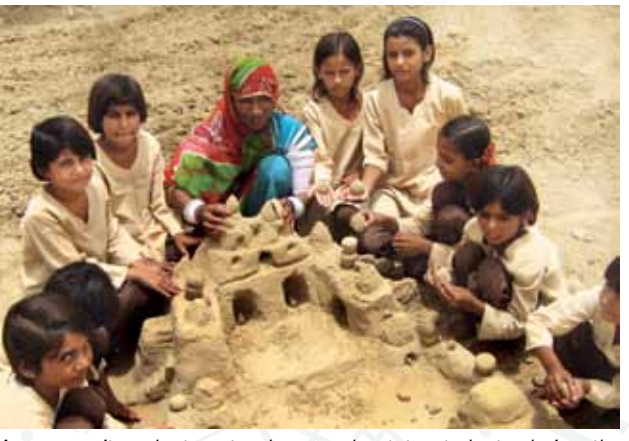
A community volunteer teaches sand art to students during the Community Volunteering Program