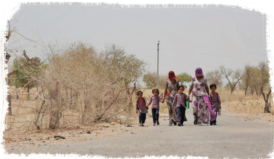
Walking their way to school – parents and children in Tena village

These children's journey to school is extraordinary not just because of the effort they make, or the unusual transport method they use. It is extraordinary because these children are in school, when millions like them in our country still are not.