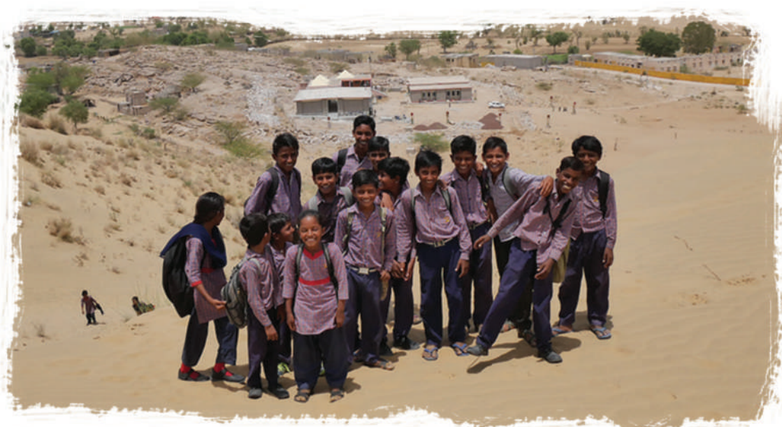
Children leaving for their homes after school in Belwa Ranaji village