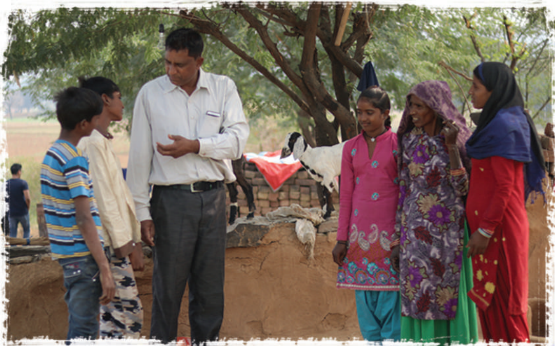
Head Teacher of the school in conversation with community members