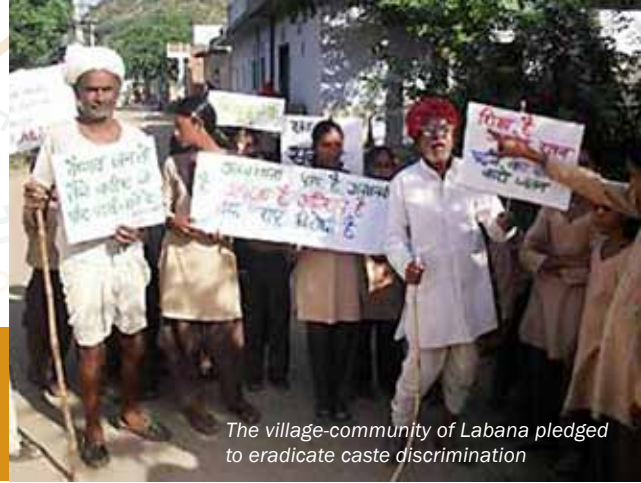
The village-community of Labana pledged to eradicate caste discrimination