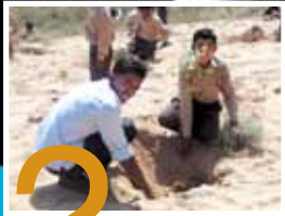
2 Design for Change School Contest 2011

Read more... Role Reversal through Education Power of the Spoken Word