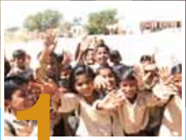
1 Leading Change in the Villages of India