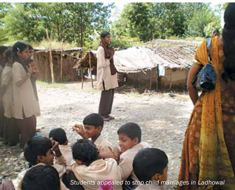
Students appealed to stop child marriages in Ladhawal

The students of Satya Bharti School succeeded in creating awareness on the ill-effects, both physical and emotional, of early marriage on young girls. This consciousness has motivated the village community to put an end to the practice of child marriage in Ladhawal.