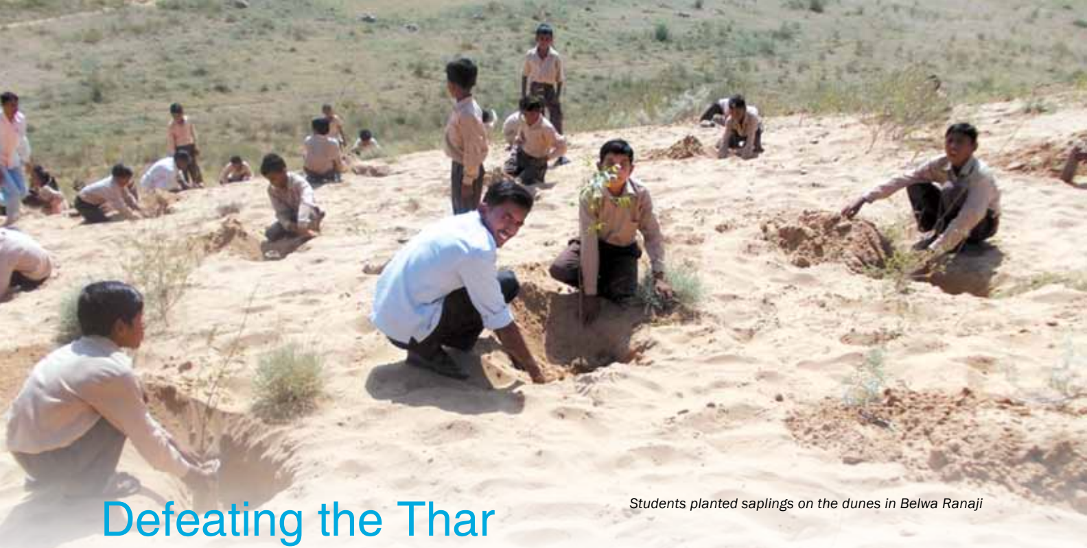
Students planted saplings on the dunes in Belwa Ranaji