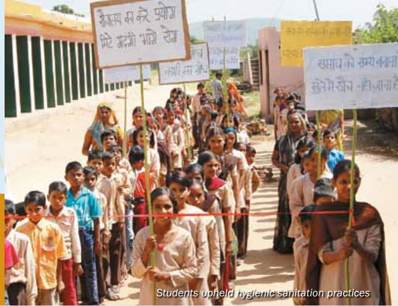
Students upheld hygienic sanitation practices

Campaign: Promoting the Use of Toilets School: Satya Bharti Government Upper Primary School, Basai Bhopal Singh, Rajasthan Number of Student Participants: Five students of Class VII and VIII Winning Category: Top 66