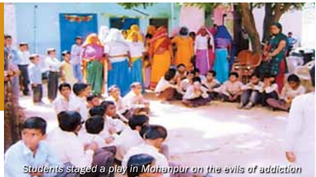
Students staged a play in Mohanpur on the evils of addiction

Campaign: Alcohol De-Addiction Initiative - Nasha Mukti School: Satya Bharti School, Mohanpur, Haryana Number of Student Participants: 14 students of Class V Winning Category: Top 66