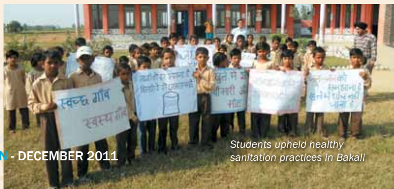
Students upheld healthy sanitation practices in Bakali

The cleanliness campaign has had remarkable impact on the village. People are now aware of the health hazards of improper disposal of garbage and therefore dispose waste in farms located outside the village. The students of the Satya Bharti School in Bakali also continue their home visits and meetings with the objective of making 'cleanliness' a habit in the village.