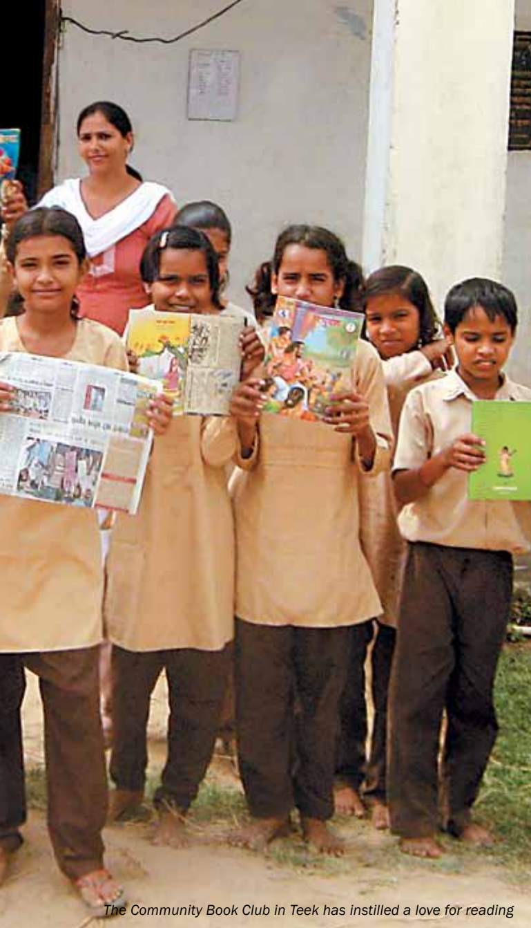
The Community Book Club in Teek has instilled a love for reading