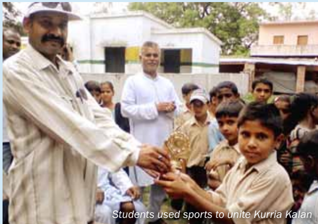
Students used sports to unite Kurria Kalan

communities believed that their children too would face discriminatory behaviour by upper class children and teachers in school and thus refrained from sending them to school. Furthermore, they were of the opinion that educating their children would serve no purpose as they would also have to do the same menial jobs as their parents.