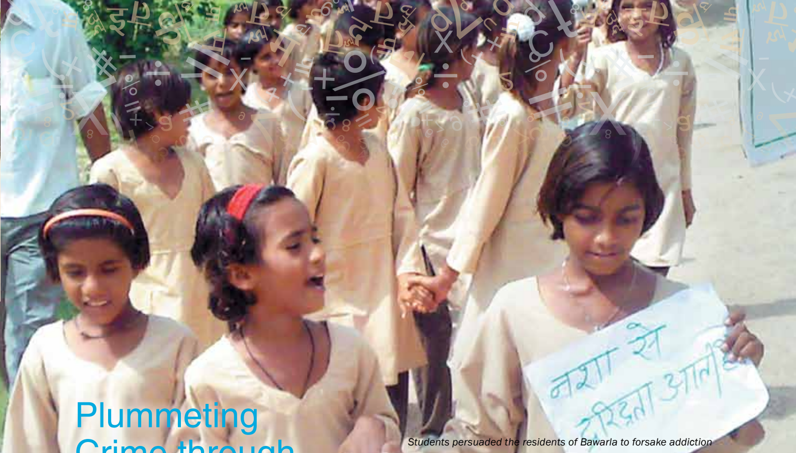
Students persuaded the residents of Bawarla to forsake addiction