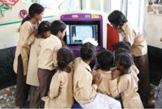
Students gather around a computer during a computer session

components of this approach includes a consciously designed “Holistic Curriculum” incorporating processes and modules that help children learn through experience and enquiry rather than rote learning.