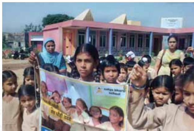
Students participate in a rally during the Girl Child Campaign

In 2009-2010, the Girl Child Campaign helped reduced the number of drop-outs of girls. The drop-out percentage of girls reduced from 1.37% in August 2009 to 0.2% in December 2009. Several Sarpanches of the villages also came forward with an oath to ensure that all girls from their respective villages will be enrolled and will regularly attend school.