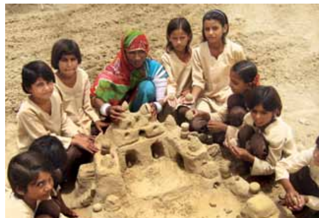
A community volunteer teaches sand art to students during the Community Volunteering Program