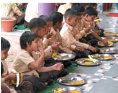
Students enjoying a mid-day meal

Some of our partners have made general monetary contributions