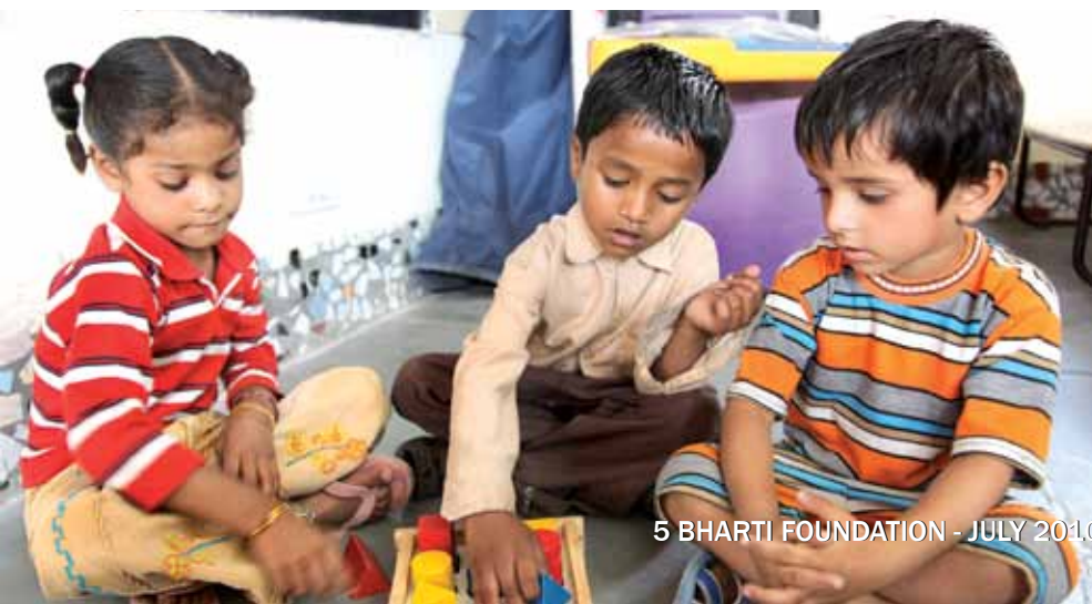
Students use interactive games to understand lessons better

Built around the guidelines of the National Curriculum Framework, the curriculum is mapped to all states boards and goes beyond text books. It also incorporates best practices of other organizations and supports teachers with guidelines and instructional material that helps them plan experiential learning for each child in the class.