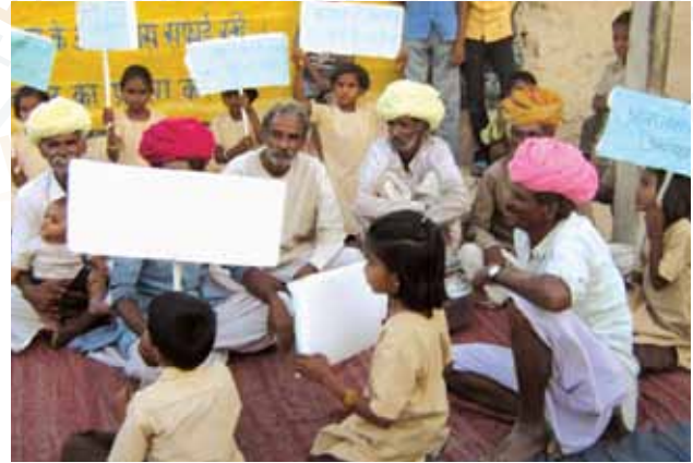
Students interact with community members during a Community Development Campaign