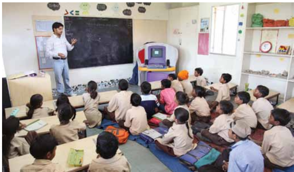
A regular day at a Satya Bharti School

While innovation, expertise and best practices are integral facets of the program, proactive intervention of teachers to undertake new initiatives also forms one of its most critical pillars. Our teachers are constantly reaching beyond the prescribed curriculum to undertake new programs and projects in order to help children learn better and with understanding. Two such examples that have helped both children and the teachers enhance the teaching-learning process are enumerated ahead.