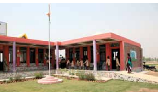
A Satya Bharti School in Punjab

ensured that the commitment of the Foundation to the thousands of underprivileged children in the country is met and duly fulfilled.