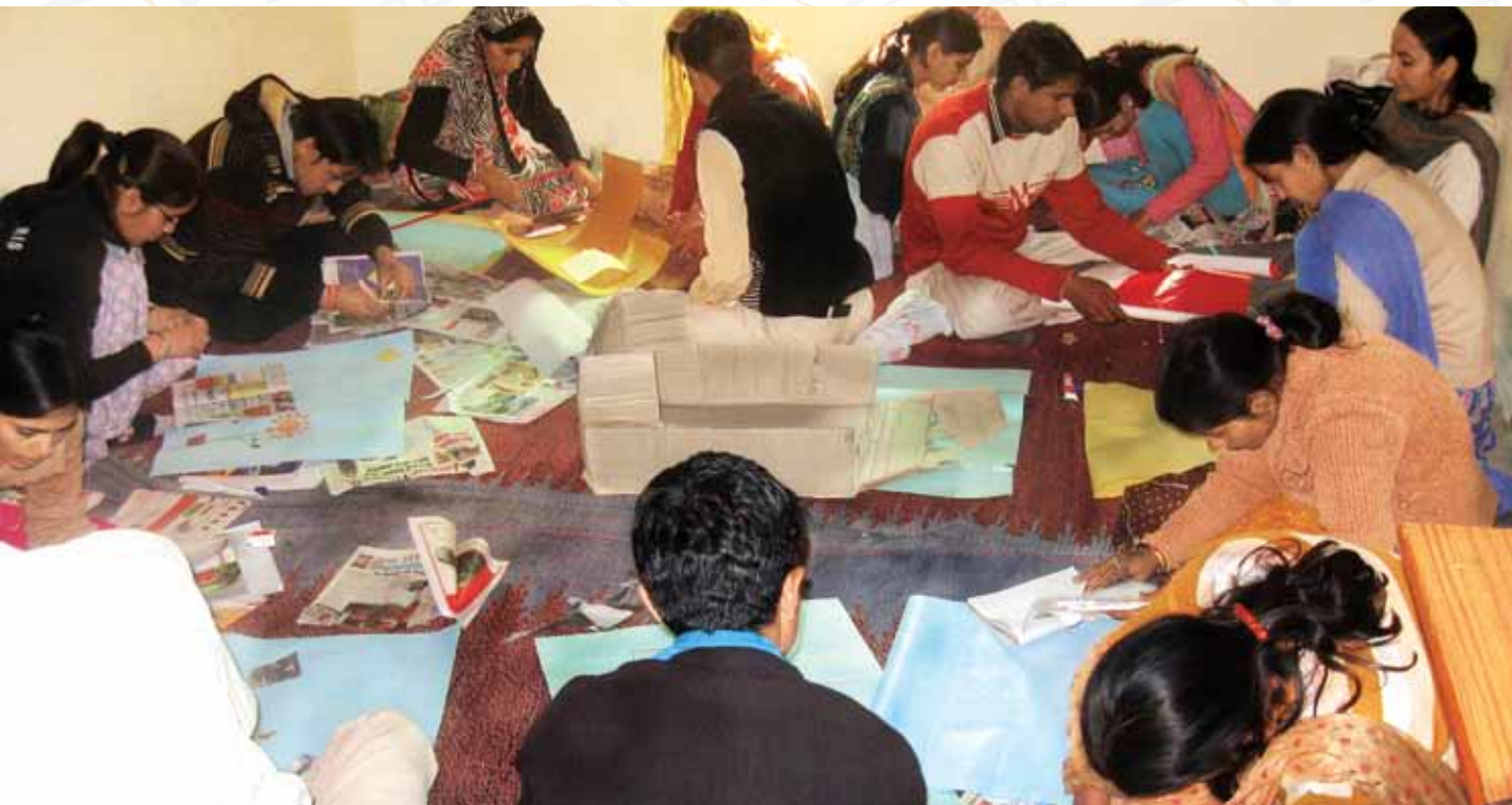
A teacher training session in progress