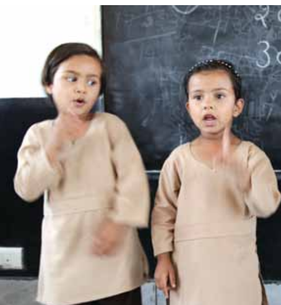
Students recite a poem during a lesson