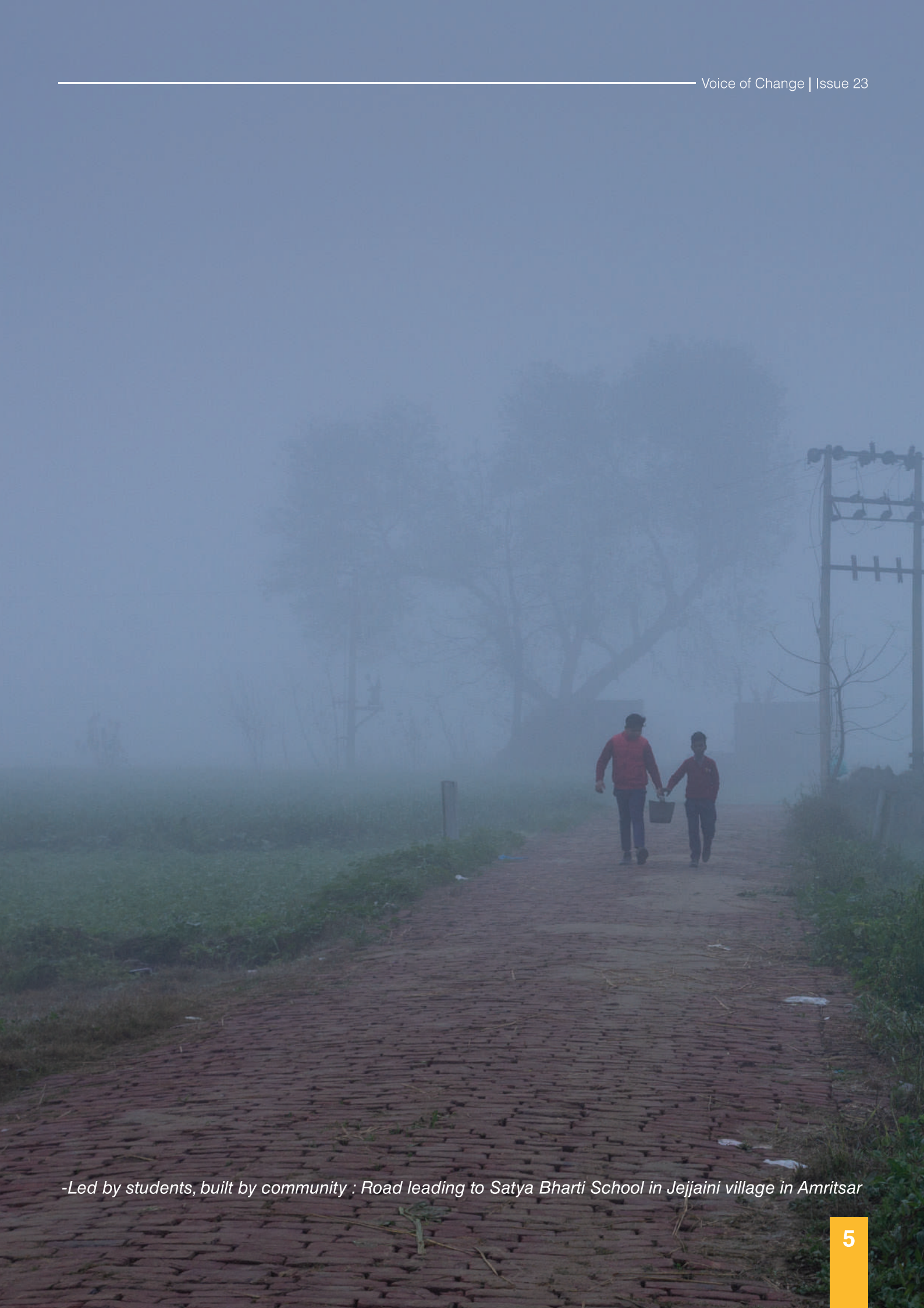
-Led by students, built by community : Road leading to Satya Bharti School in Jejjaini village in Amritsar