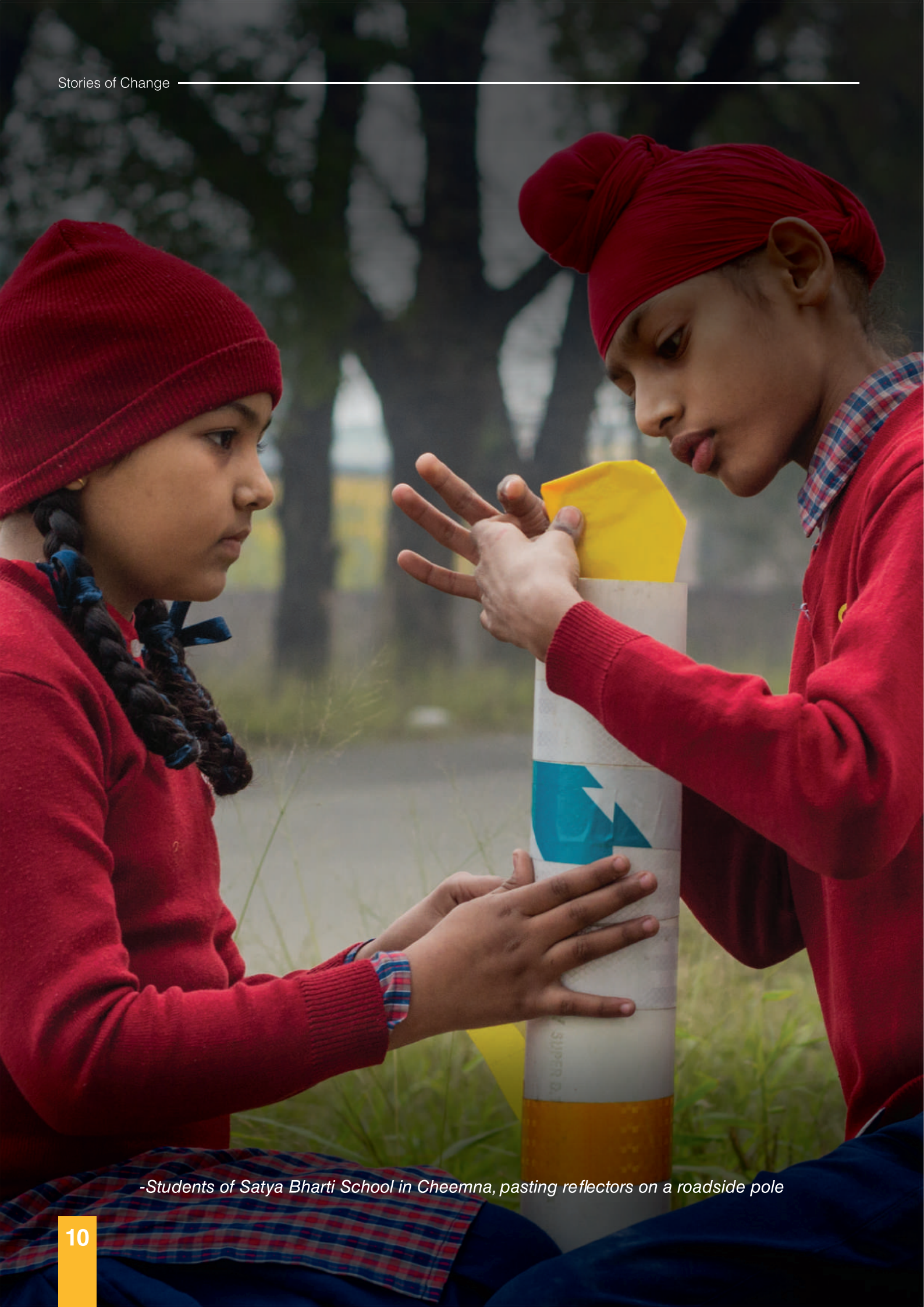
-Students of Satya Bharti School in Cheemna, pasting reflectors on a roadside pole