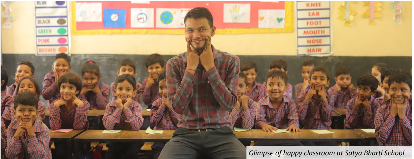
Glimpse of happy classroom at Satya Bharti School

*Satya Bharti education programs and partner education programs **Includes students, teachers and community member