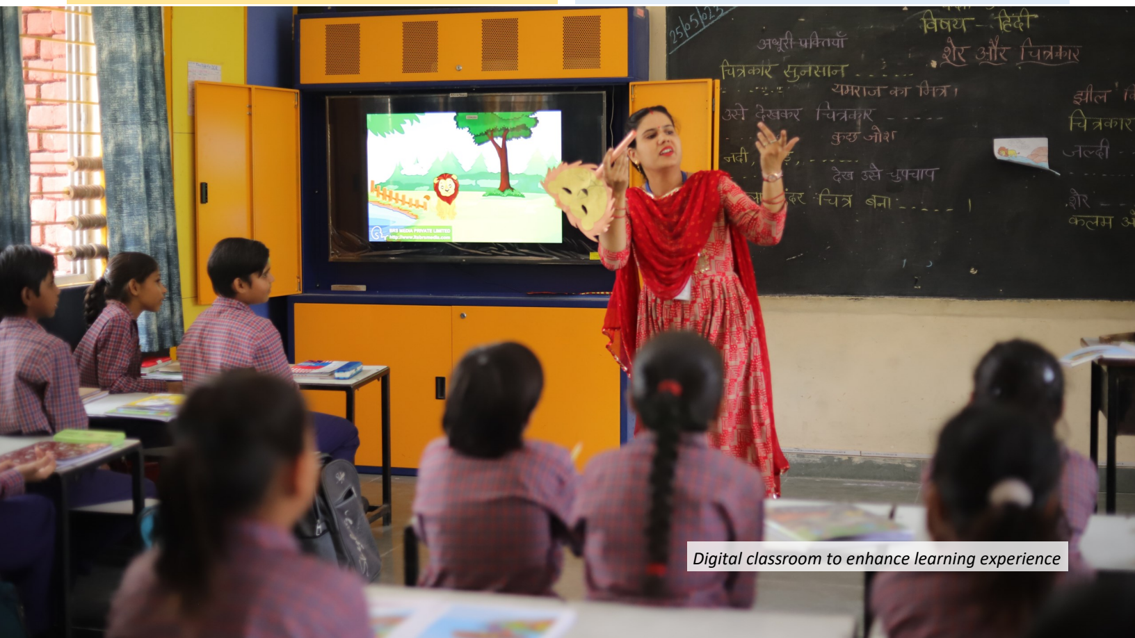
Digital classroom to enhance learning experience