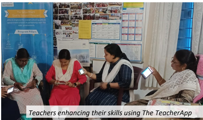
Teachers enhancing their skills using The TeacherApp

TheTeacherApp (TAPP) aims to 'help teachers uplift their schools'. It is our belief that happy & energized schools, engaged teachers, students and parents are key to school-transformation. The focal point of the platform is to empower teachers, school leaders and educationists with high quality, engaging content.