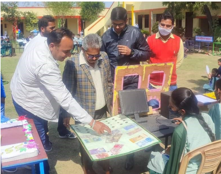
Student exhibiting projects to parents and community

If schools become engaging and happy spaces, it would result in holistic development of students as they acquire leadership, communication, collaboration, and other important life skills. The Program currently partners with more than 800 Government schools across 11 States/UTs.