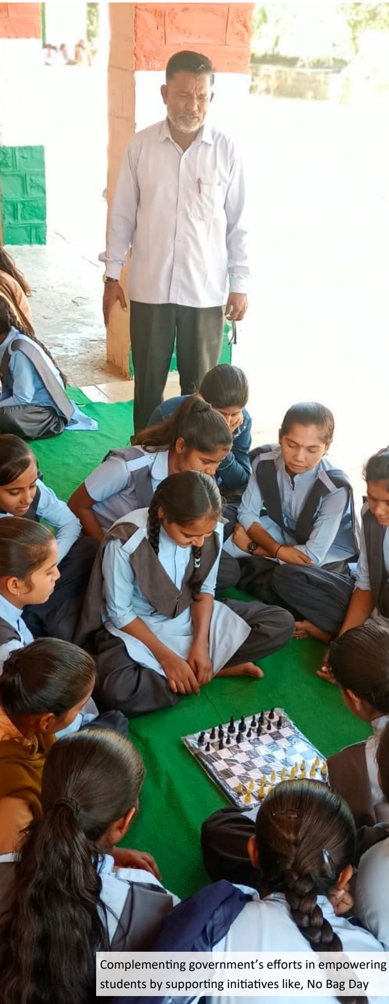
Complementing government's efforts in empowering students by supporting initiatives like, No Bag Day